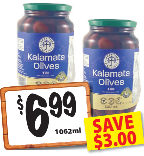
Jesse Tree Kalamata Olives